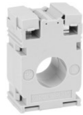
Current transformers DM0T0080